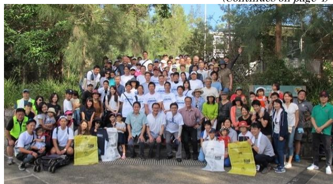
120 people gathered for the nation-wide volunteer event at Lane Cove National Park. (03/03/19)