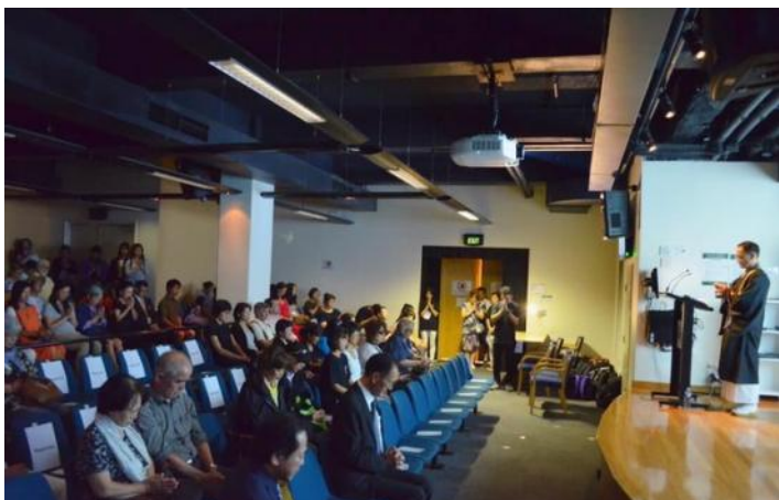
Dedicated people gathered for the commemoration ceremony event held at Sydney Mechanic's School of Arts, NSW. (11/03/19)

Eight years have passed since the huge earthquake and tsunami struck north-east of Japan on 11 March 2011.