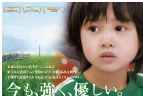
We watched a documentary Movie called "Life Goes On", which showed us how effected people recovered from the disaster.