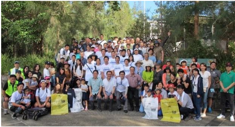
120人が一堂に会した今年の集合写真！(03/03/19)

お昼前にそれぞれが自分が歩いた公園内で収穫(!)したゴミを持ち帰り、それを一緒に集め、一息してから、待ちに待ったBBQを頂くことに。