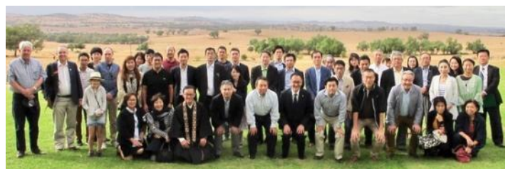
Group photo at the Cowra Breakout site. (17/03/19)