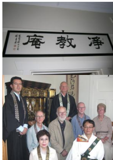
Obutsudan dedication service on Friday 15 March 2009 at Jokyo-an, Adelaide.

Our dojo is very small. It seats no more than six people. Its 'temple' name is Jokyo-an – Jōkyō's place. It is where I teach the dharma and worship each day. While our little dojo is maintained by two members of the Hongwanji Buddhist Mission of Australia, for most people living here on the far-eastern