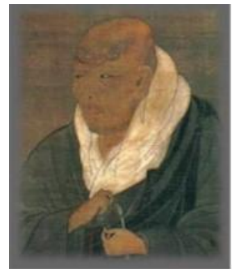
Shinran Shonin (1173 - 1263)

"We are not good persons, nor are we persons of wisdom."