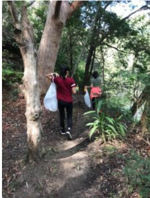
(top) Participants went out for collecting rubbish in the park. (bottom) We made Lane Cove National Park even more beautiful park taking away this many rubbish! (03/03/19)