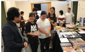
(Top) Home-made Bento, (bottom) fundraising market.

(2:46pm Japan time), which is the precise moment that the 9.0 magnitude undersea earthquake hit.