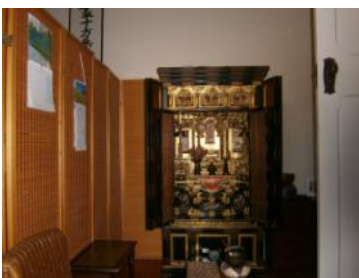
Inside of Jokyo-an, as of today.

We do not ask our members to join us except for our meetings, which we hold twice a month on Sunday. But it is hard for people to pin themselves down to a regular time. So only a regular small cohort of rarely more than three people meet regularly on Sunday mornings. Far more people call in at special times to suit themselves. We talk about their lives and the dharma, some-