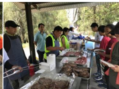
(左) 沢山のゴミを拾った後は、(右) 美味しいお昼のBBQに舌鼓を打たせて頂きました。朝からBBQ当番だった皆様ご苦労様でした！(03/03/19)