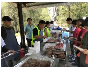
Everyone enjoyed delicious BBQ! (03/03/19)