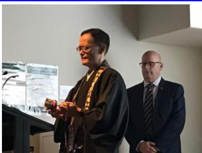
Chanting before the silent meditation.

This tragedy left more than eighteen thousand people dead or missing. We can never forget the images we saw on television that day of the black, wall-like tsunami rushing over the Sendai Plain at tremendous speed. The images of many fishermen bravely heading out to sea in order to safeguard their vessels are also etched deeply into our minds. The nuclear power plant accident, which followed the earthquake and tsunami, has forced many people to leave the places where they used to live because of radioactive contamination. Efforts are being made to improve the situation, but our hearts ache to think of the