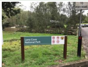
Lane Cove National Park

After collecting much rubbish, we gathered once again for the BBQ lunch. We all enjoyed a delicious lunch together and had fun talking about each of our own personal clean up day experiences.